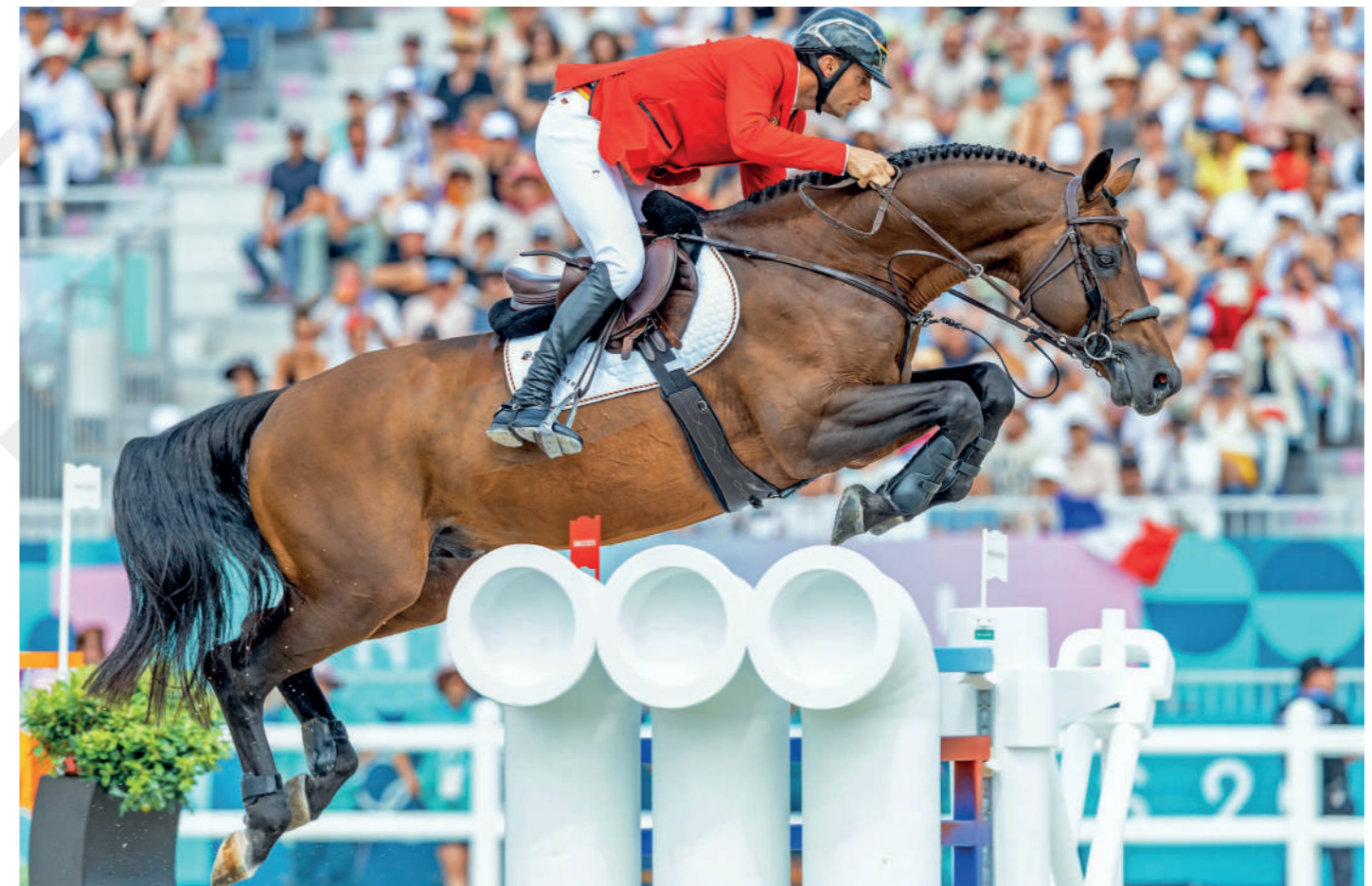
- United Touch S (West. 2012 - Untouched x Lux Z) e and Richard Vogel.

Fedor de Seves (S.F. 1993) _____ RUBIS DE PRERE (S.F. 2005) - EV